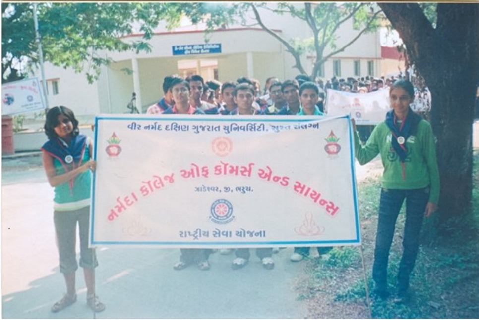
The NSS Wing of the College participated at the inter collegiate NSS activity organized by Veer Narmad South Gujarat University, Surat