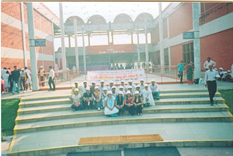
Special Olympics at Gujarat Narmada Valley Fertilizer Corporation's Sports Complex