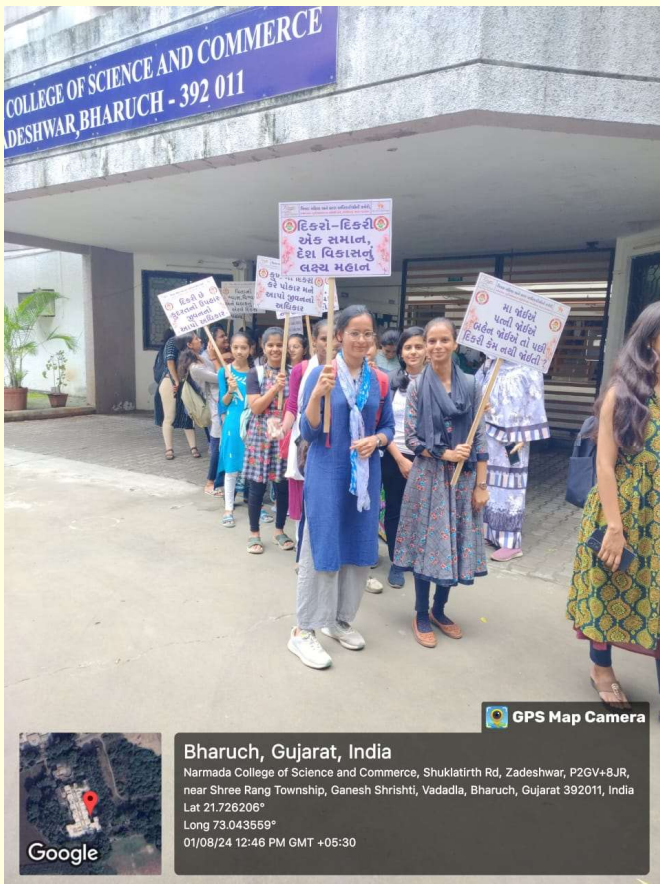
Students as Participants: All BBA students